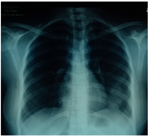
Figure 1: Chest x-ray showing left basal tuberculoma

The evolution at nine months of treatment was characterized by the regression of active lesions including the collections of soft parts, weight gain, with a vicious left call in the form of coxarthrosis.