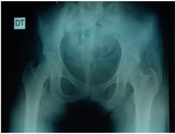
Figure 2: Front pelvis x-ray showing pinching of the left coxo femoral line space.